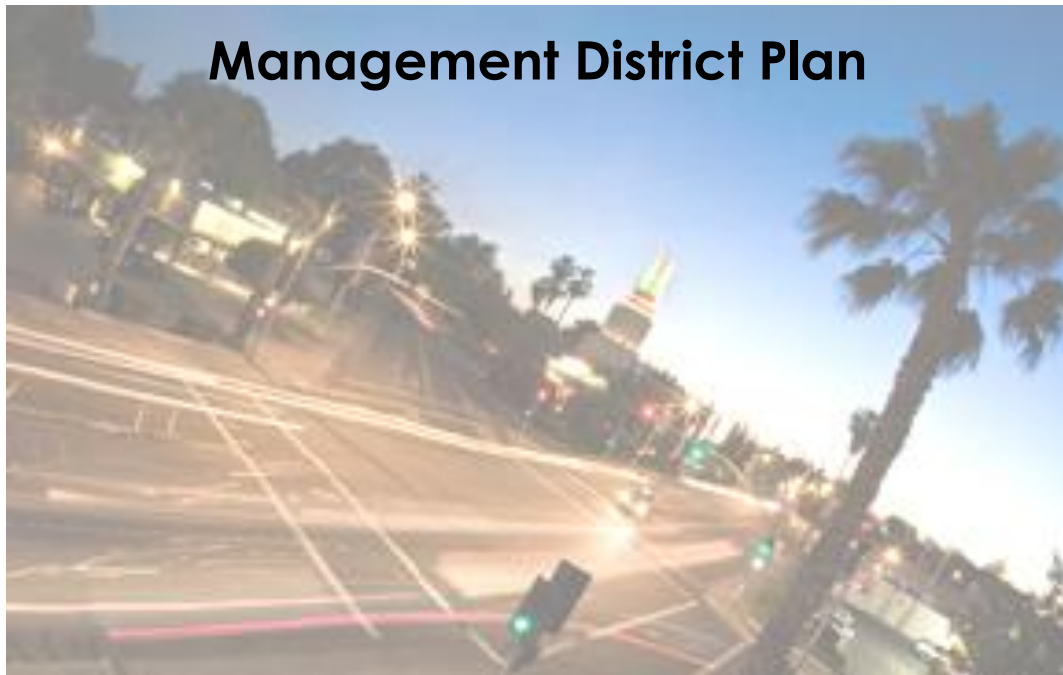
EXHIBIT C Greater Broadway Property and Business Improvement District No. 2012-01

Prepared pursuant to the State of California Property and Business Improvement District Law of 1994 And Article XIII D of the California Constitution to create a property and business improvement district